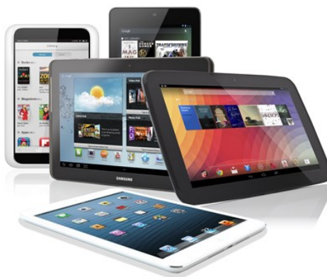
Mainstream Tablets and Smart Phones