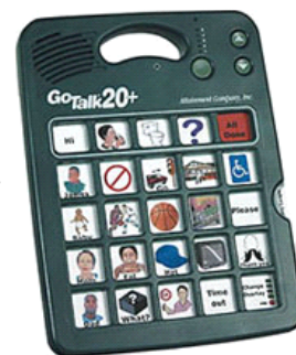
Go Talk 20+ Communicator