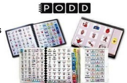
Pragmatic Organisation Dynamic Display Communication Books

This refers to any communication system that is “non-electronic” and is used to assist communication. Examples are communication boards, Pragmatic Organisation Dynamic Display (PODD) communication books; and visual resources such as community request cards, timetables, mealtime place mats, Talking Mats, chat books, and various other resources that support communication. These often involve the use of pictures, words, and spelling.