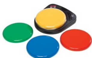
Big Step by Step Communicator