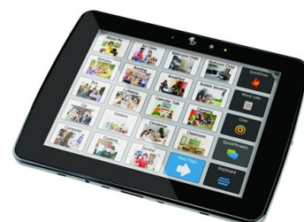
Tobii Dynavox T-Series