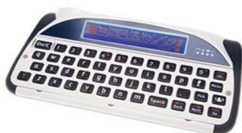
Lightwriter SL40 Text to Speech Communicator